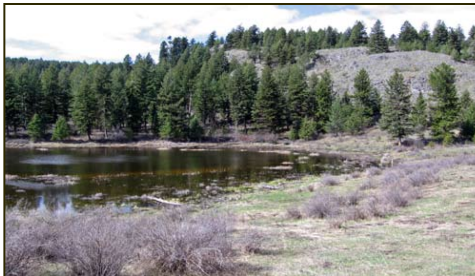
Site of enhancement project along northern lakeshore