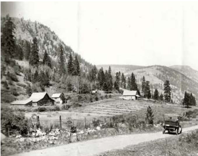
Spikeman Ranger Station--Early 1900's

Wildlife was the impetus behind purchase of private land in the Sinlahekin in 1939. The Washington Department of Game, predecessor to the Washington Department of Fish and Wildlife (WDFW), created the Sinlahekin Wildlife Area for the primary purpose of enhancing winter range for mule deer. Today the wildlife area, containing nearly 14,000 acres, covers much of the Sinlahekin Valley and surrounding hillsides and is managed for a diversity of wildlife species. Over 215 species of birds, 60 species of mammals, about 20 species of reptiles and amphibians, over 25 species of fish, and over 85 species of butterflies are confirmed or suspected of being present on the Sinlahekin Wildlife Area during some part of their life cycle.