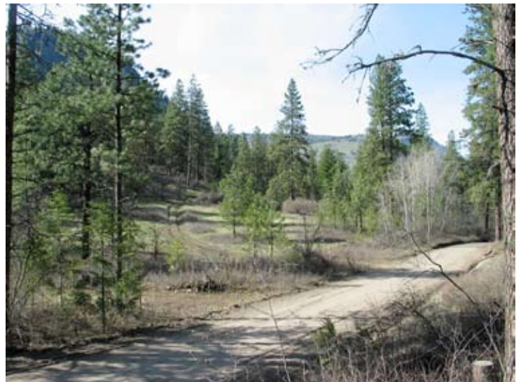
Site of old Spikeman Ranger Station in today's Sinlahekin Wildlife Area