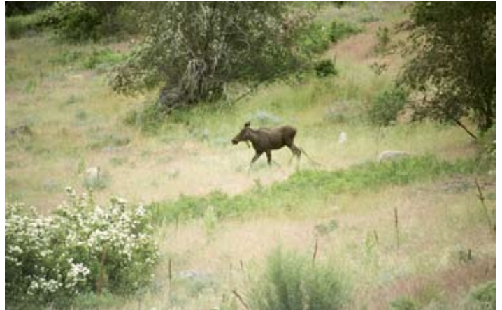
Moose spotted in the Sinlahekin is one of 60 known mammal species

For more information on the Sinlahekin Wildlife Area, visit their website at www.wdfw.wa.gov/lands/wildlife_area/sinlahekin .