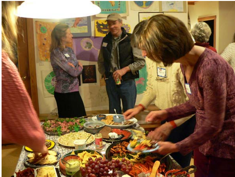
Participants enjoyed light refreshments during the event.

The poems read were from Okanogan Poems Coyote Springs Series Volume 1 , the first book in a series inspired by the beautiful Okanogan region. A handful of the books are available through the OVLC office or online at http://www.wlbooks.com . Only 300 copies were printed so be sure to get your copy soon.